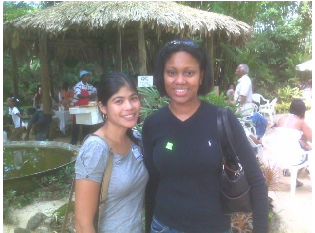
Who's Who at La Vega