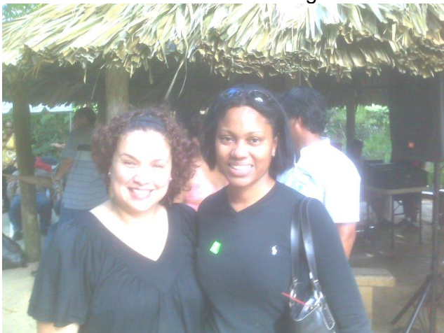
16 th Anniversary Reunion at La Vega Estate Who's Who at La Vega