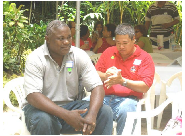
Who's Who at La Vega