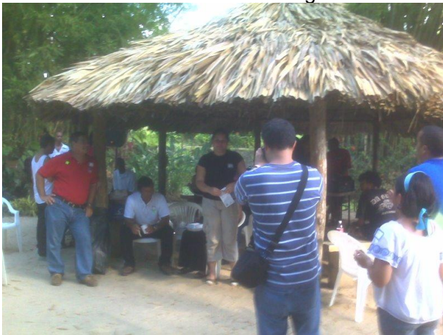
Who's Who at La Vega