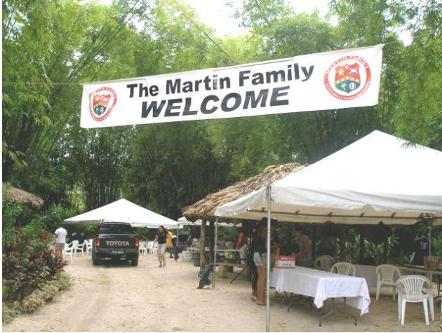
The Venue Guest Speaker