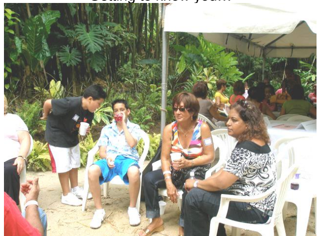
The younger generation