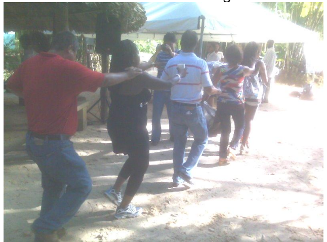
Must be the conga line! Who's Who at La Vega