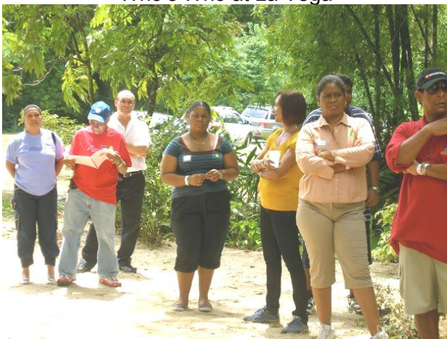
Strangers when we meet – family when we leave!