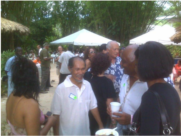
Who's Who at La Vega