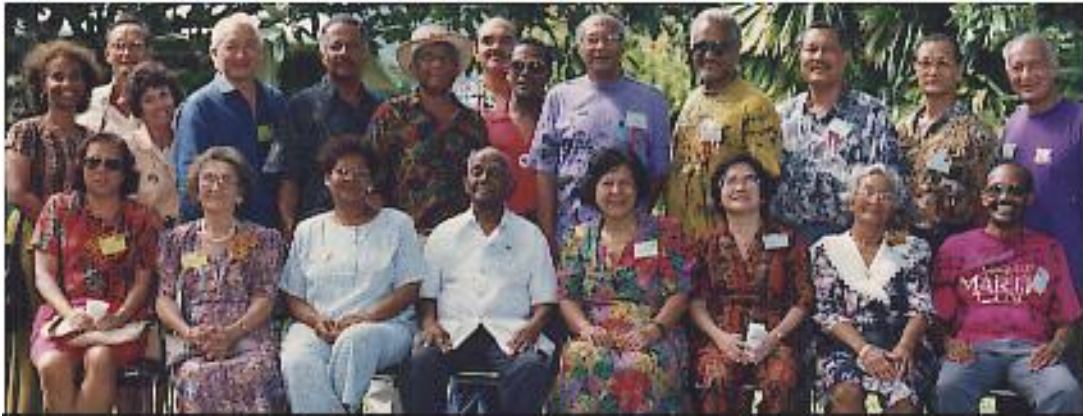
The first Sponsors 1992

Following the incorporation and official launching of the Foundation on October 8, 2008 at the Coblenz Inn, Port of Spain, ( http://members.shaw.ca/chowmartin/foundation.html ) the next step envisioned was to get the MFRC and the COE to determine ways and means whereby the aims and objectives as laid out in the MFF Constitution could be achieved for the benefit of the family at large.